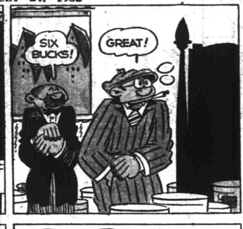
SUNDAY, JULY 24, 1932 GREAT! BUCKS!