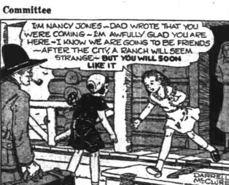
By DARRELL McCLURE