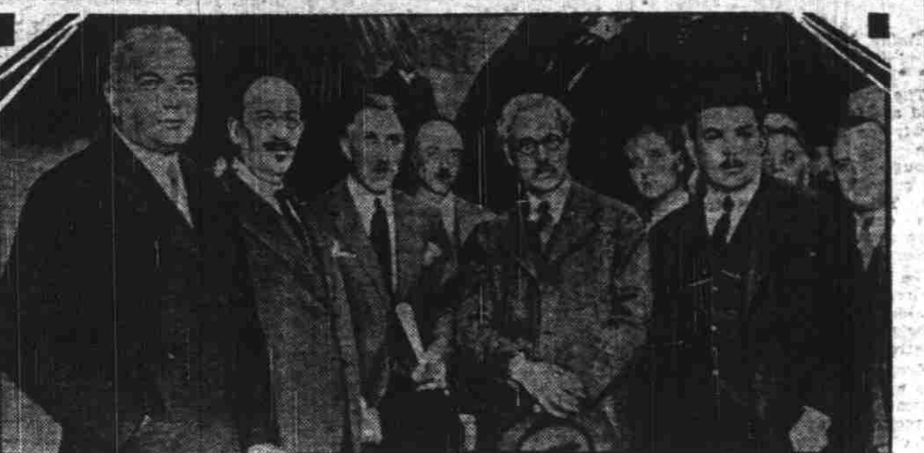
EUROPEAN STATESMEN AT LAUSANNE CONFERENCE.