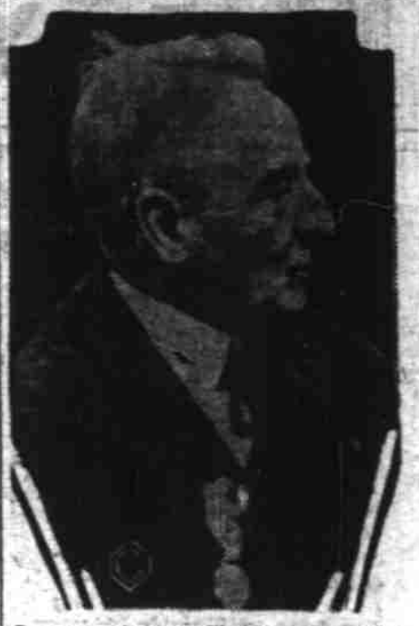
Senator Carter Glass of Virginia presented this interesting study as he was snapped by the Candid Camera in his seat in the Old Dominion's State section at the night session of the Democratic convention. The Senator was one of the few delegates that did not show signs of strain due to the terrific heat.