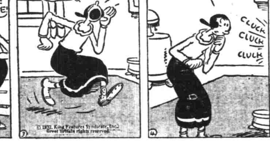
The Only Way Out