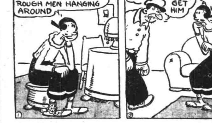
THIMBLE THEATRE—Starring Popeye