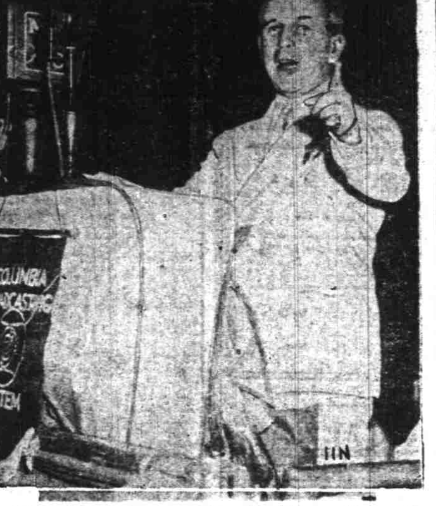
To John J. Raskob, chairman of the national Democratic committee, falls the honor of opening the Democratic convention in Chicago. He is shown posed on the rostrum in the Chicago Stadium.