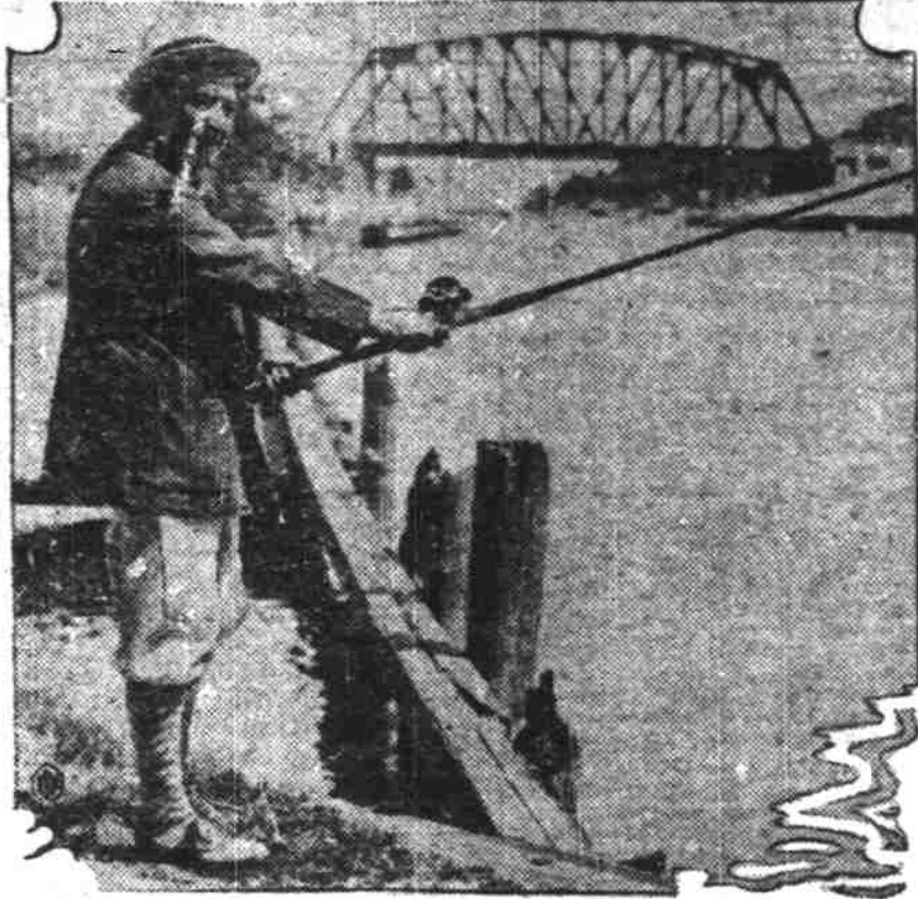
Although he is said to be fishing for the Democratic nomination for the Presidency, former Governor Alfred E. Smith of New York, was after smaller game when this picture was made. The "Happy Warrior" is shown at Hampton Bay, L. I., where he spent a short vacation from politics. Al didn't say what bait he was using, but made it clear he was fishing for fish.