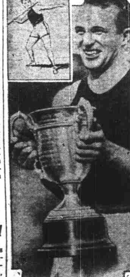
By virtue of three victories out of the ten events and a tie for first in