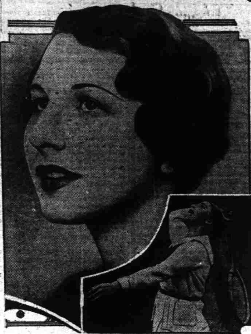
The dancing braids of her early career and the neat little knot at the nape of her neck that were the crowning glory of Queen Helen Willis Moody have gone the way of all the hair and succumbed to the barber's scissors. Photo shows Queen Helen with her new bob. Inset is a picture of the tennis queen when she was battering her way to the top of the net world. Note the swinging pigtail.

league goes into a huddle tomorrow night at the chamber of commerce to check up on its campaign against foreign solicitors, advertising racketeers and other out-of-town salesmen who have either tried or succeeded in pushing their wares and services into the hands of Salem