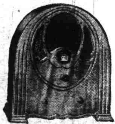
1932 BABY GRAND

Delivers One of These New 1932 Model Philcos to Your Home — This Pays Insurance for a Whole Year