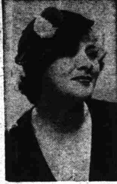
These two styles of hat for the lady who would be correct in her gear are safe and smart.