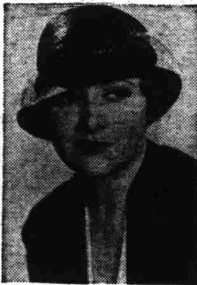
Kathryn Crawford MGM in a Prystalline Florentine tan

stoles, capelets, and scarfs, either all of fur, or of fur and fabric combined. The coats themselves usually feature tiny built up collars, to which the other is entirely unattached, except through perfect fit.