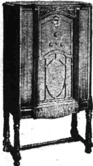
1932 PHILCO LOWBOY CABINET

We will take your old radio in on one of these new 1932 Philco radios.