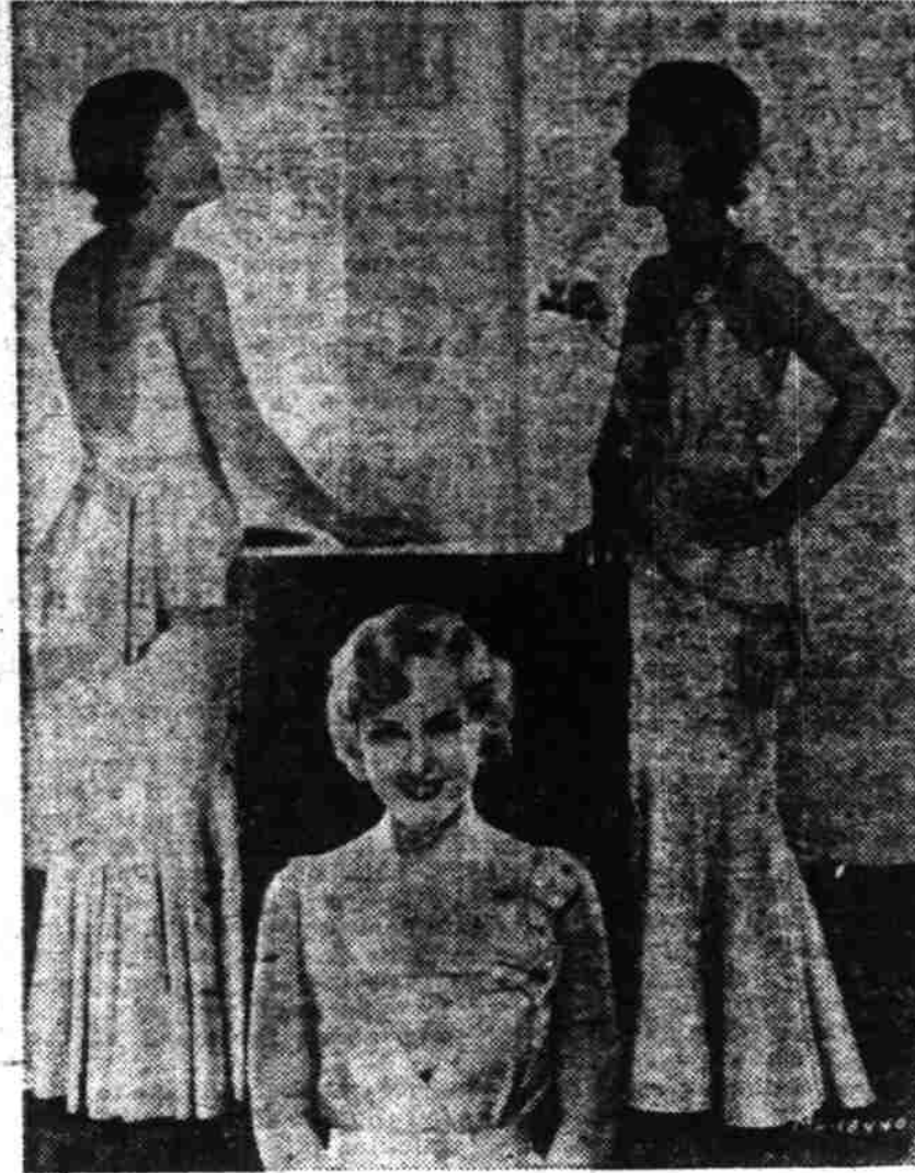
There must be something over the shoulders to be smart for evening wear. Just a bit to "cover up" with, but the back may be as low and exposed as is desired.