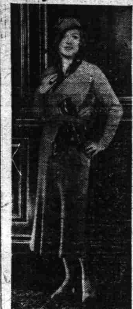
Note the collar and otherwise severe plainness of the gown. Smart colors or unusual sleeves bear the brunt of making gowns "different" this year.