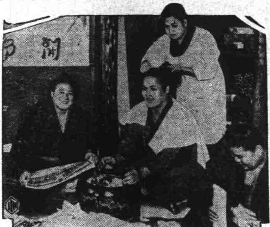
Take a peek into the dressing-room of Musashiyama, the champion wrestler of all Japan. The mighty man of muscle is shown having his hair combed and plaited just before he defended his title recently. Musashiyama has signified his intention of invading the United States as a professional boxer. One wonders what the reaction of American fight fans would be on seeing the husky matman in the squared circle with his crowning glory all dressed up like a Christmas tree.