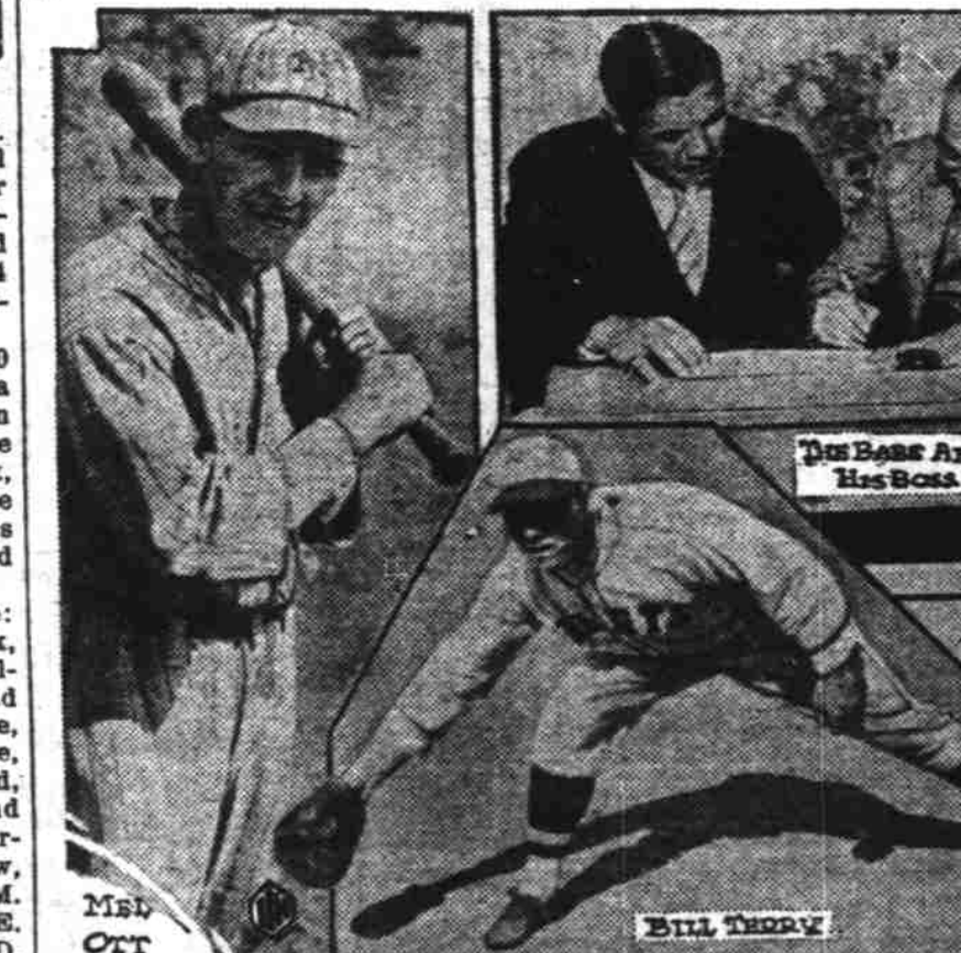
Old Man Depression is taking his toll in the baseball market and the number of holdouts increases as contracts for the coming season reach their destinations. Mel Ott, of the Giants, is the first of the announced holdouts to fall in line and sign up at a reduced figure. Mel's teammates, Bill Terry and Fred Fitzsimmons, have stated they will not sign. Terry going so far as to declare his wish that the Giants trade him. Hack Wilson, late of the Cubs but now of the Cards, doesn't like the salary offer of his new bosses and is still unsigned. While the