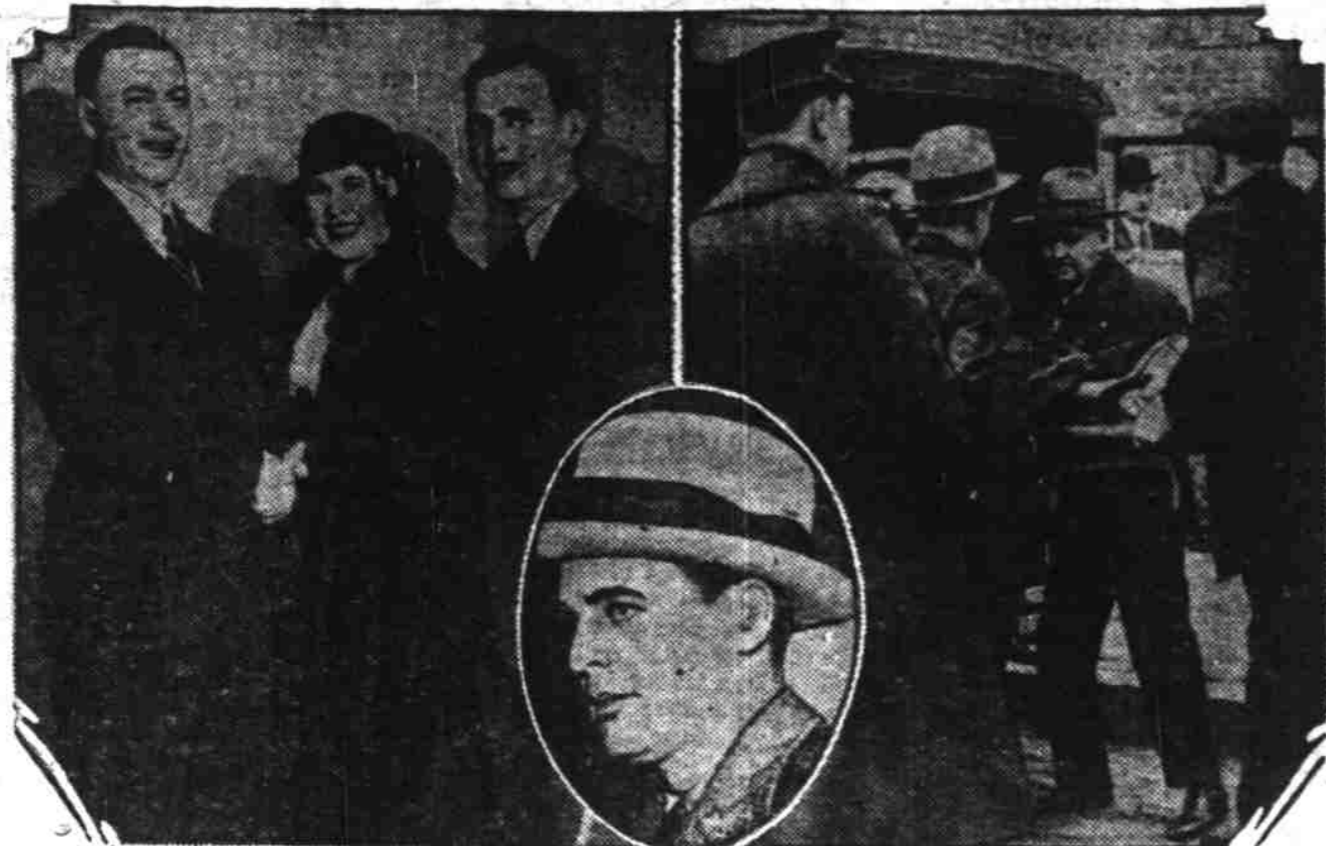
DIAMOND (Right) ON EVE OF DEATH JACK 'LEGS' DIAMOND HIS LAST RIDE The rigging down of the curtain upon the career of Jack "Legs" Diamond, the New York sneak thief, more than ever emphasizes the truth contained in the slogan: "You can't get away with it." Arrested 25 times for crimes ranging from petty larceny to murder, Diamond, the New York sneak thief, was sentenced to power in the underworld, served but one short sentence in a reformatory. Consequently, he sneered at the laws of the country and broke them just as he pleased. But the code of gang- land could not be so lightly violated, as Diamond found to his cost. Three times he survived when rival gangsters pumped bullets into his consumptive body, but this last time his enemies took good care that there should be no recovery. Entering the rooming house in Albany, N. Y., where Diamond was sleeping off the effects of a gay party, held to celebrate his acquittal of an abduction charge a few hours earlier, gunmen put three bullets in his brain, giving fresh significance to the warning "YOU CAN'T WIN."