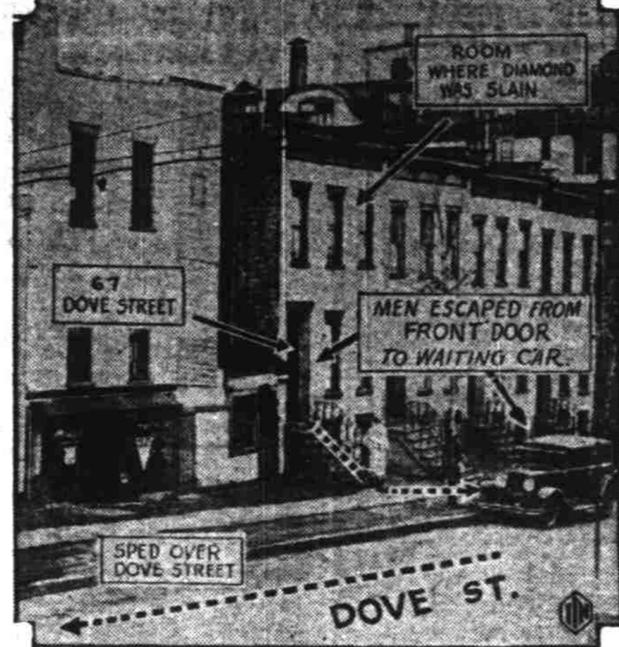
This photo-diagram shows the scene of the execution by gangdom of Jack "Legs" Diamond, New York sneak thief, who wanted to be emperor of the underworld. Diamond had taken up his quarters in a cheap rooming house at Albany, N. Y., to throw his enemies off the trail, and secure in the belief he had succeeded, went to bed to sleep off the effects of a party in celebration of his acquittal on an abduction charge. He never woke again, as the bullets fired into his brain caused instant death.