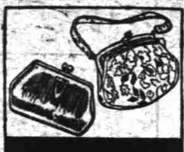
Give Handbags this Christmas Best We've Ever Sold at

Fine weaves of silk and wool! Reinforced heels and toes. A gift you know he'll like!