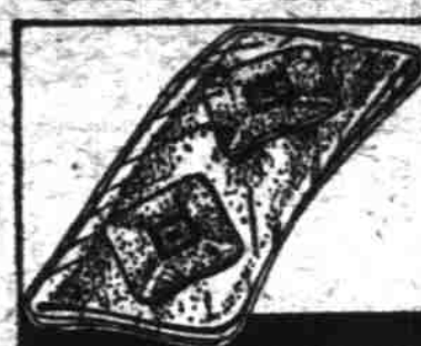
Towel Sets in Cellophane Exceptional Values at

A great variety from which to choose! Envelope & frame styles of calf & grain leathers—lined. Mirror & purse.