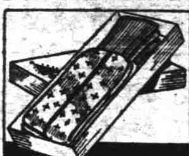
A Man's Gift! Dress Sox! In A Smart Box!

Check off the men on your list with this! Desk Pen, 7" long, 14-kt. gold point; mottled barrel. Onyx pen holder.