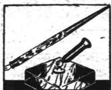
Fountain Pen and Desk Sets Useful and Ornamental