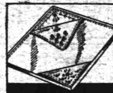
Handkerchiefs in Gift Boxes Tiny Gifts—Big Values

Lingerie gets first choice when she selects her own gift! Combinations, Daise sets of pure silk.