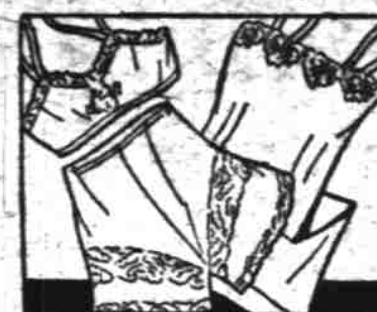
Honeymoon Crepe Silk Lingerie No Finer Gift for Her!

Last Christmas you'd have paid this for the towel alone! Fluffy Towel & Wash Cloths—gay borders.