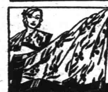
Women's Smart New Silk Scarfs! Gifts She Would Choose