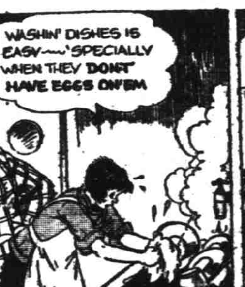
"A Large Obstacle"