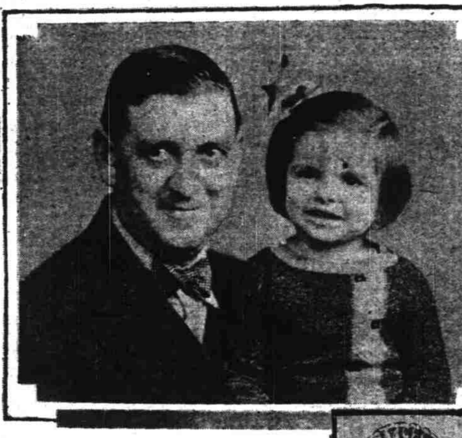
TODAY "grandfather" breaks into the society page and with his grandchildren he anticipates "Thanksgiving" day when all his children and grandchildren will come trooping home.