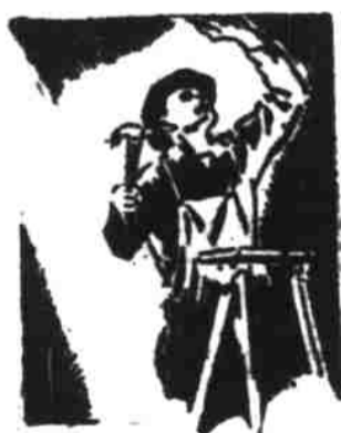
Make an Extra Room of Your Attic