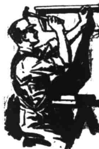
A New Shelf or Cabinet