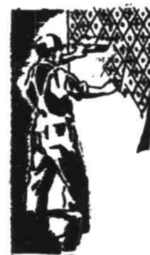
Wall Papering and Interior Decorating