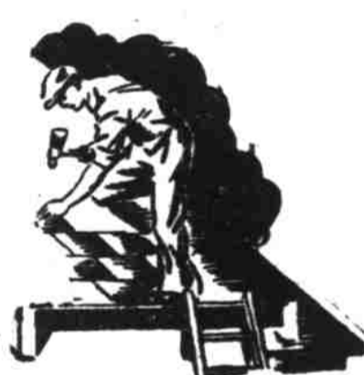
Leaks are Caused by Broken Shingles