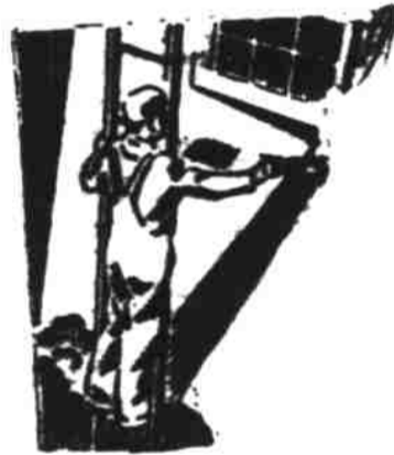
Exteriors Should be Painted in the Fall