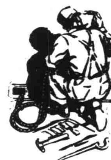
Extra Electric Outlets in Your Living Room

These Pages Sponsored by the Salem Chapter of the Oregon Building Congress and Made Possible by the Following