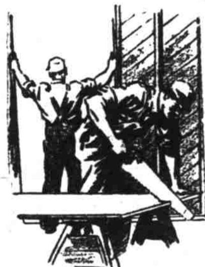
Additional Rooms Added to Your House