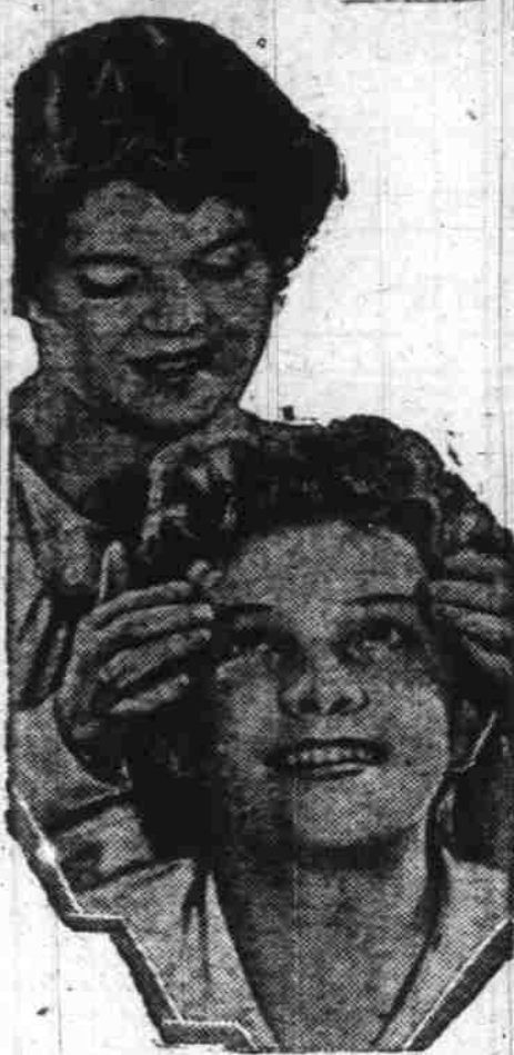
The gay story of "Penrod and Sam" is suggested from this scene from the picture of that name which will come to Warner Bros. Elsinore Friday and Saturday.