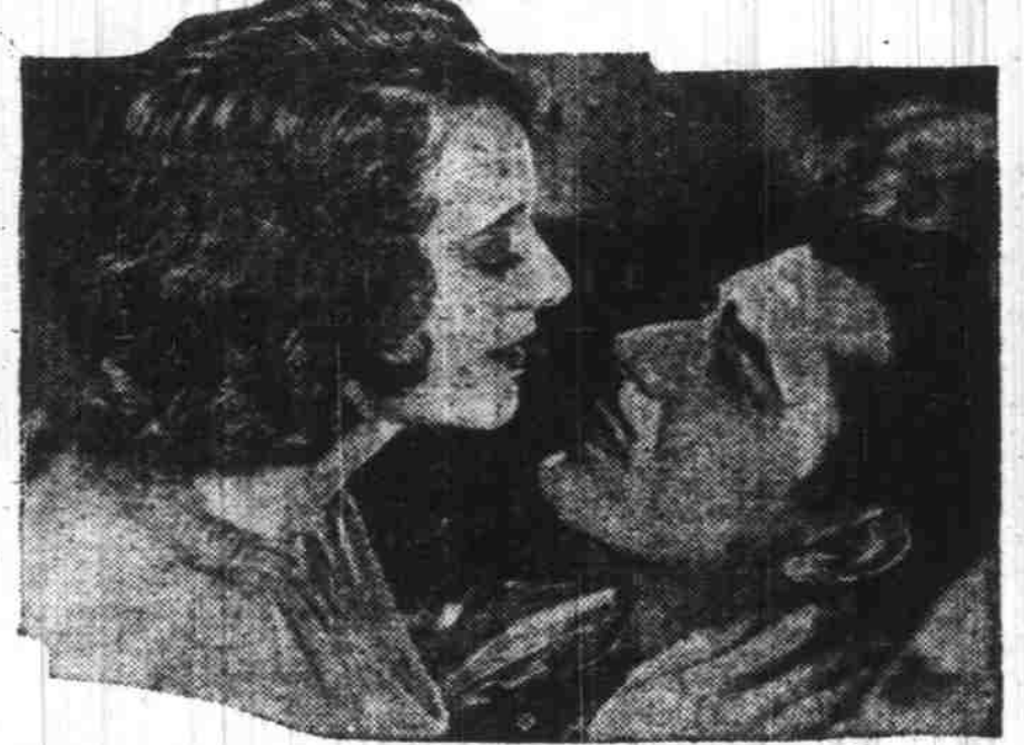
The Grand will present for a week beginning Sunday "Daddy Long Legs" with Janet Gaynor and Warner Baxter in the feature roles. The above is a glimpse of one of the more "sentimental" scenes of this "once upon a time" story.

A former Austrian army officer plays a comedy Frenchman in William Haines' latest starring picture, "Just A Gigolo," based on the Belasco stage success, "Dancing Partner." The new picture, which will come Wednesday to Warner Bros. Elsinore theatre, is a romantic drama of Europe, with Haines in an unusual role as a British nobleman. The heroine is Irene Purcell. In the role she played on the stage, C. Aubrey Smith, Charlotte Granville, Lilyan