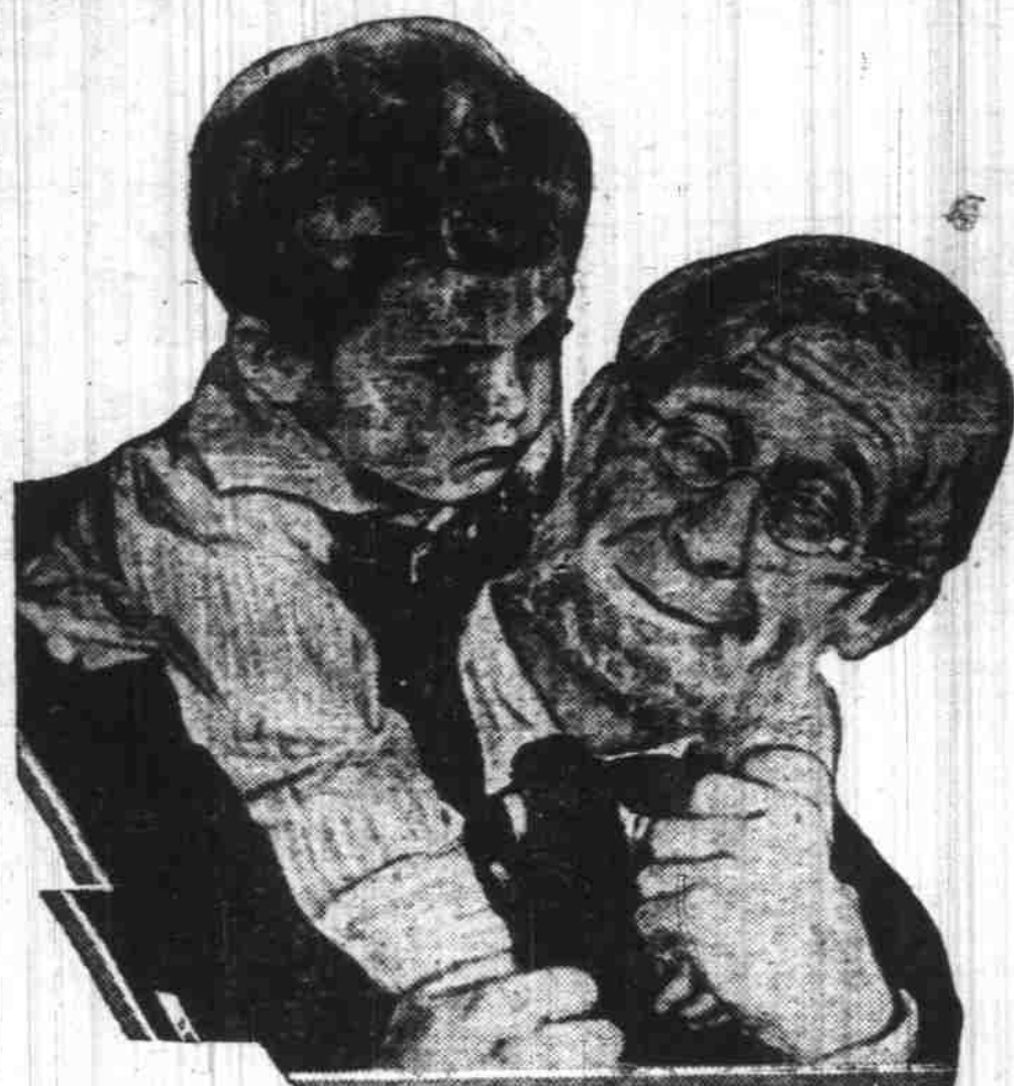
An amusing glimpse of "Chic" Sale and Dickey Moore in "Star Witness" which will be the Sunday feature at Warner Bros. Elsinore today.