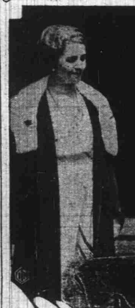
Calvin Coolidge, former President of the United States, earned congratulations the other day when he observed the fifty-ninth anniversary of his birth and probably the fifty-eighth time he had officiated over a birthday cake. Here the former chief executive and gracious Mrs. Coolidge, with evident enjoyment, are shown presiding over the traditional birthday delicacy at their home at Swampscott, Mass.