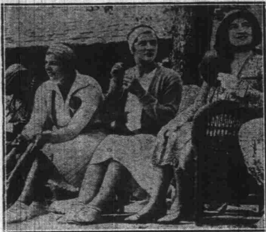
The "bench" on the sidelines is not too lowly a seat for the royal family of Great Britain, as this picture shows. The Duchess of York, wife of the second son of King George and Queen Mary, is shown at right with Helen Jacobs, California tennis star (center), and Betty Nuthall, England's ace of the courts (left) while the players take a rest between matches at London.