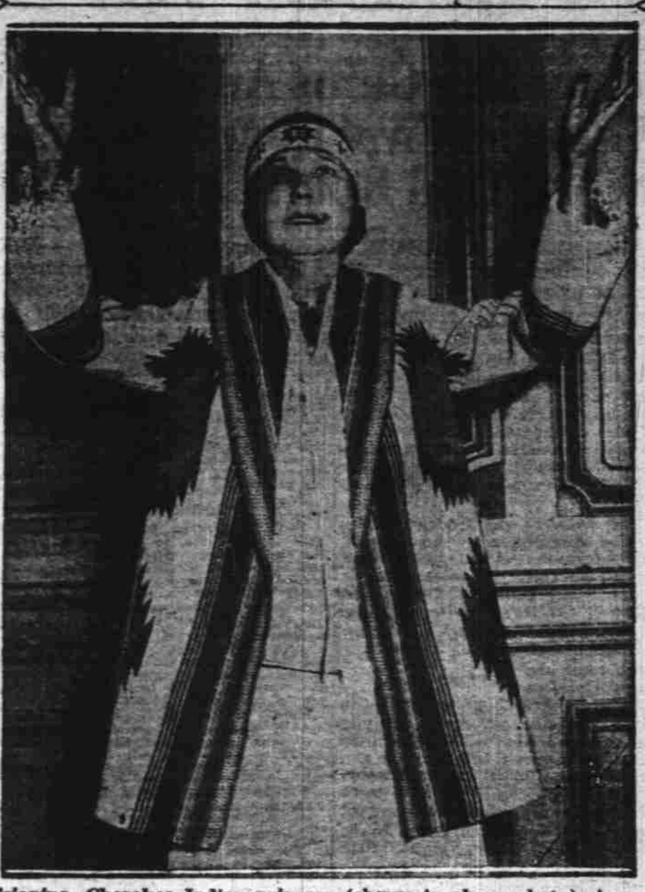
Tsianina, Cherokee Indian princess (shown in above photo), is one of the colorful figures attending the National Federation of Music Clubs convention in San Francisco. The beautiful Indian girl was the inspiration for Charles Wakefield Cadman's opera, "Shanewis," and she sang the leading role in the Hollywood Bowl production in 1926.