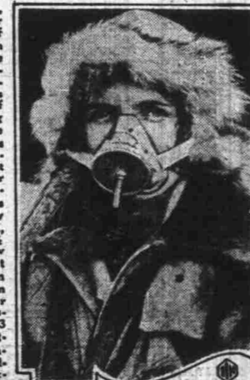
DRESSED FOR ALTITUDE HOP

From this point, Ruth's flying career takes on the aspect of a triumphal march made up of one achievement after another. Among her remarkable performances was the completion of a 12,000-mile flying tour in which she visited forty-six States in the interest of aviation, and all without one forced landing or a single mishap. In December, 1930, Miss Nichols flew from New York to Burbank, Cal., in 16 hours and 59 1/2 minutes, setting a new record for women. But her return flight from the Coast was even more remarkable, for she made the transcontinental trip in 13 hours, 22 minutes, bettering all records (including Colonel Lindbergh's) with the exception of Capt. Frank Hawks.