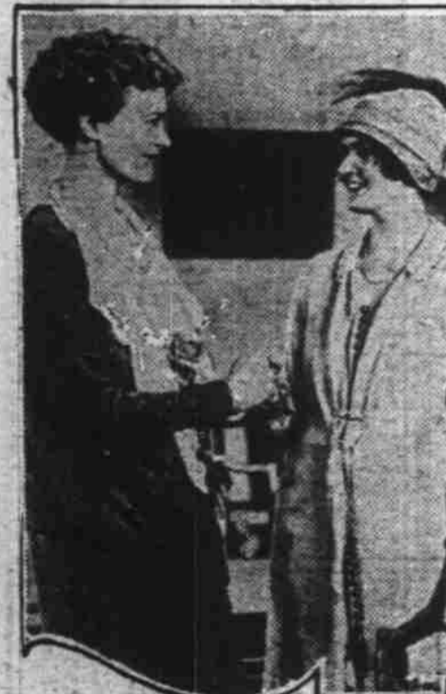
WITH AMELIA EARHART (left)