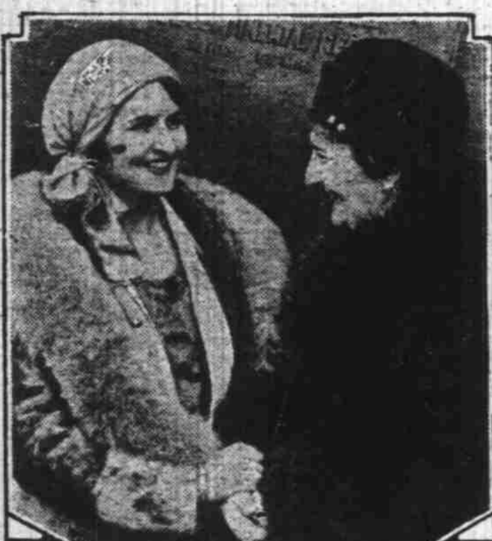
RUTH and MOTHER