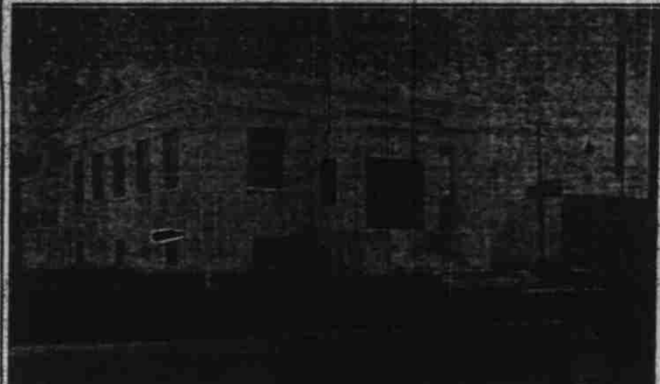
View of new city hall at Mt. Angel. Business men turned out in a group Tuesday to haul 55 loads of dirt to fill in for a lawn around the new city hall. They'll go back to the job again soon.