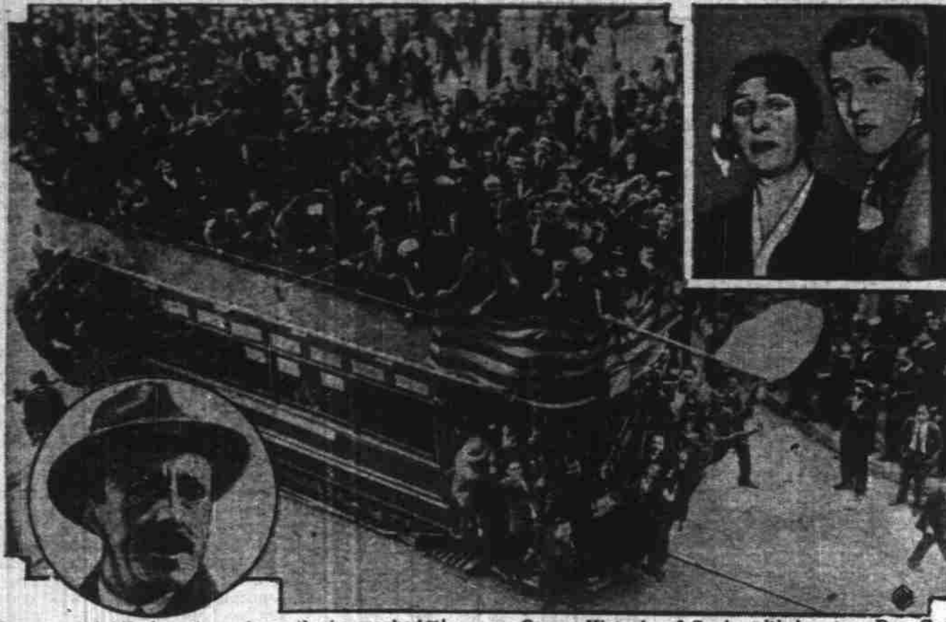
Scenes of jubilation throughout Spain marked the fall of the monarchical rule of the House of Bourbon and the departure of Alfonso XIII to exile. Picture shows a carload of celebrants in a street of Madrid greeting the new Republic. (Upper right) ex-Queen Victoria of Spain with her son, Don Gonzales, taking a last look at her former kingdom as her train crossed the French frontier. (Lower) Alfonso XIII, the dethroned king, as he appeared on his arrival in France to join his family.