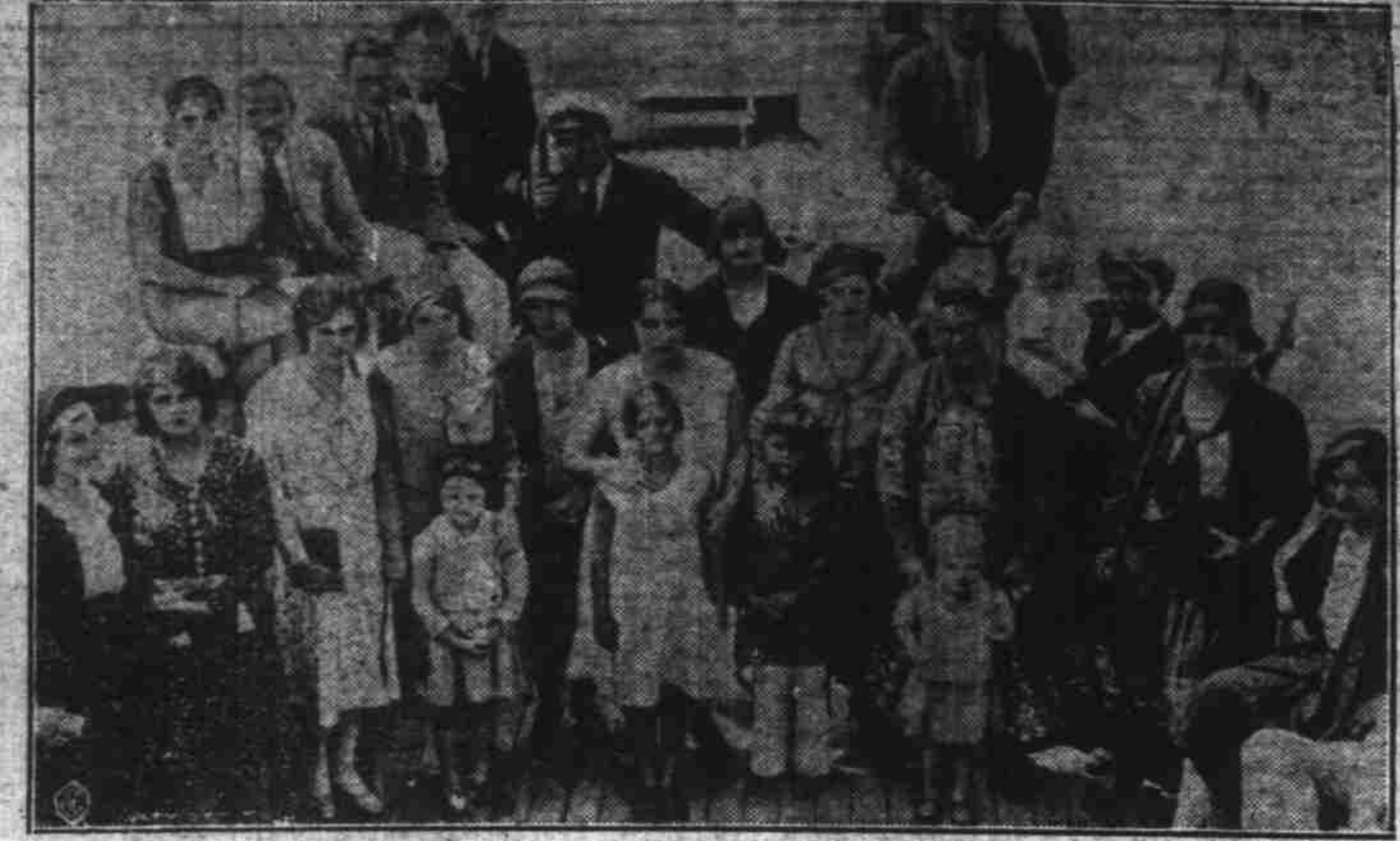
Refugees from Nicarnguan insurrectionists pictured on board the Cefalu on arrival at New Orleans and than 1,000 Americans to whose nuccor the Government ment has ordered three cruisers

decision will be made until fall. At that time those who wish to join may plan to unite with the Liberty organization, if one can not be carried on here.