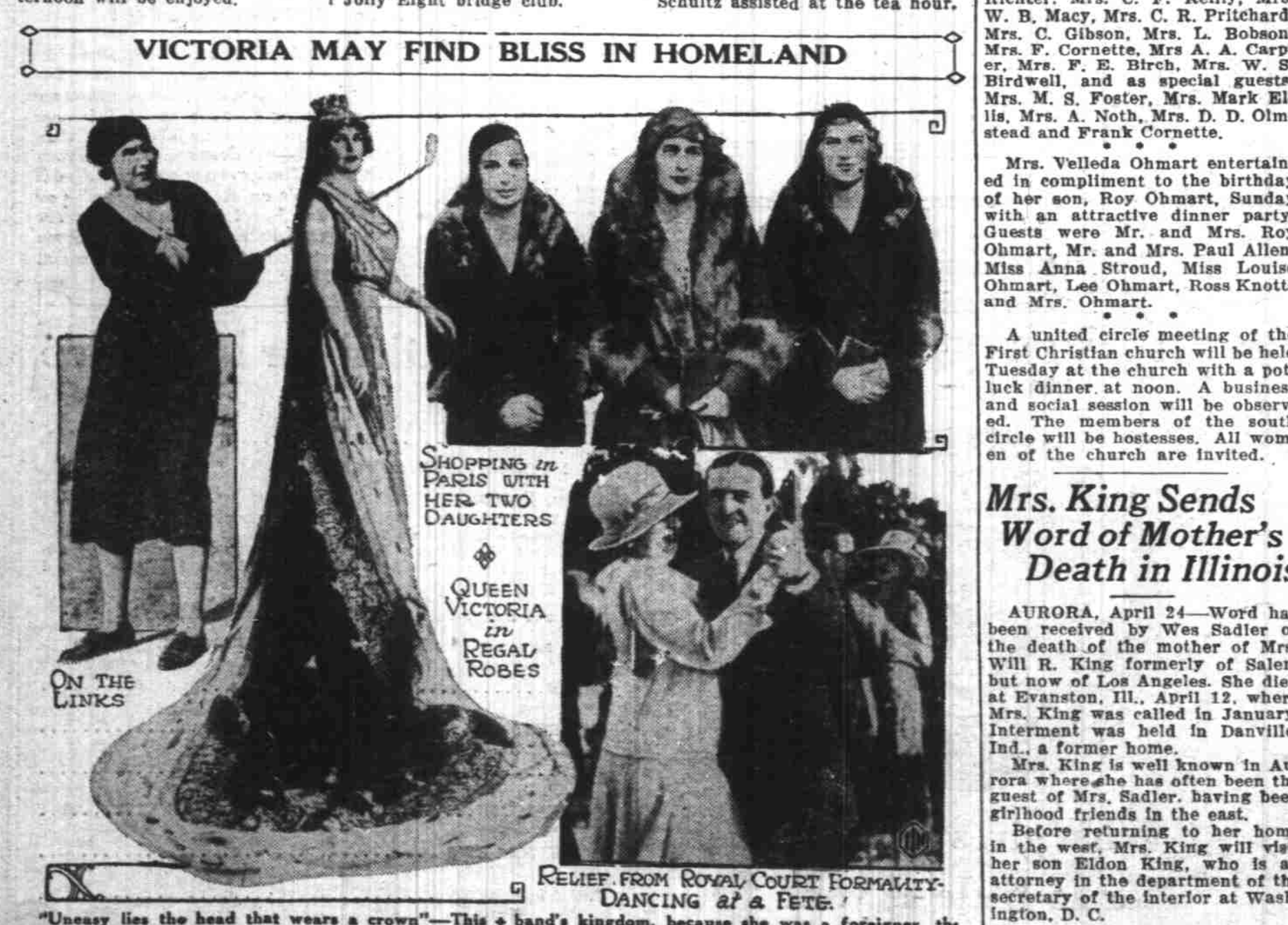
QUEEN VICTORIA IN REGAL ROBES SHOPPING IN PARIS WITH HER TWO DAUGHTERS RELIEF FROM ROYAL COURT FORMALITY—DANCING AT A FETE! "Uneasy lies the head that wears a crown"—This fact has again been brought home to Queen Victoria of Spain, as she bade farewell to the land over which she had ruled with Alfonso XIII. From the simple life of a British Princess, she had a quarter of a century ago become a part of the court of Spain, puzzled by its restrictions and formality. The road from carefree Kensington Palace to Madrid was not a path of roses. Disliked by the people of her husband's kingdom, because she was a foreigner, the mother of an ailing family, her first born, suffering from an obscure blood disease, her second son, a deaf-mute, it would appear that her cup of sorrow had been filled—without being forced to exile from the land over which she had ruled. Perhaps fate will deal more kindly with the dethroned Queen who may return again to the land of her youth, far from the strife that was here as Queen of Spain.