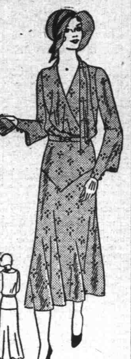
By ANNE ADAMS

The popular one-sided accent is given this charming frock with the scarf and surplice bodice, further softened and graced by a flared raver. The skirt flare joined in downward point, has just the right amount of fullness. Pattern 2009 boasts, also, fashion's latest sleeve, fitting snugly at the wrist and flaring between wrist and elbow. It makes up beautifully in plain or printed flat crepe, georgette, marocain or satin. No dressmaking experience is necessary to make this model with our pattern. Yardage for every size, and simple, exact instructions are given. Send fifteen cents for each pattern. Write plainly your name, address and style number. Be sure to state size wanted. The new spring and summer pattern catalog features an excellent assortment of afternoon, sports and house dresses, lingerie, pajamas and kiddies' clothes, also delightful accessory patterns. Price of catalog fifteen cents. Catalog with pattern twenty-five cents. Address all mail and orders to Statesman Pattern Department, 243 West 17th street, New York City.