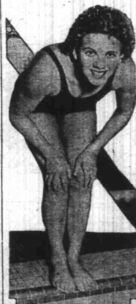
Georgia Coleman, of Los Angeles, world's premier girl diver, shows the form with which she prepares for her dives. Georgia is unquestionably the greatest female diver ever developed, and includes among her specialties many of the dives included in the repertoires of male champions. She demonstrates her means of defending her title in the meet at New York.