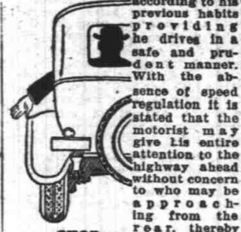
STOP & SLOW