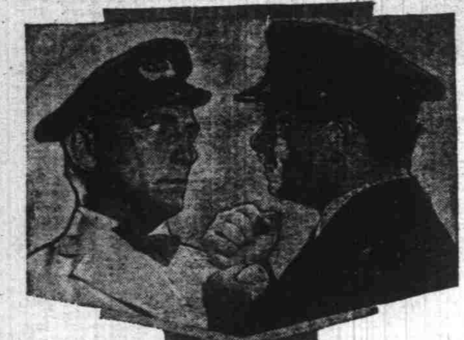
George Bancroft and William Boyd in "Derelict" now showing at the Hollywood.