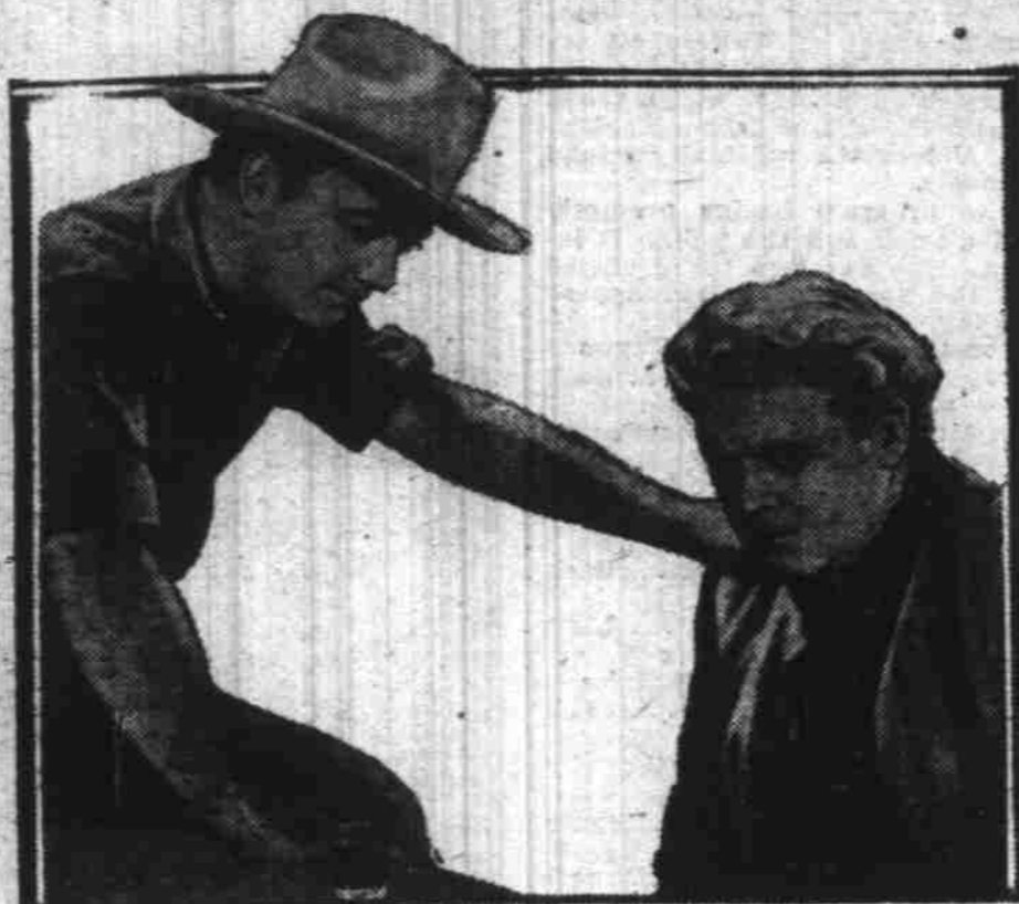
William Boyd and William Farnum in "The Painted Desert" opening today at Warner Bros. Capitol theatre.