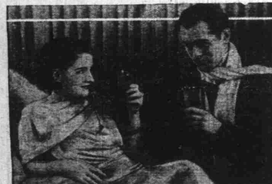
Norma Shearer and Robert Montgomery in a scene from "Stranger May Kiss" which comes to Warner Bros. Elsinore, Wednesday.