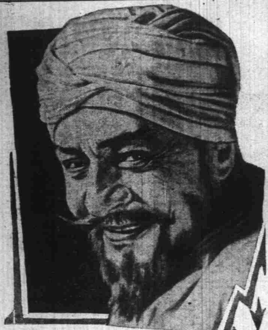
Otis Skinner in "Kismet" at Warner Bros. Elsinore theatre Sunday, Monday and Tuesday.