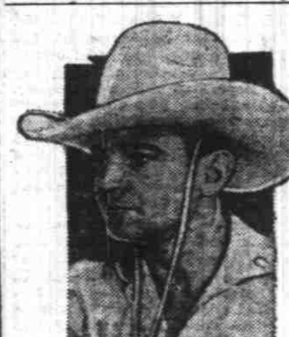
Buck Jones who will be seen in "Dawn Trail" at the Grand Friday.