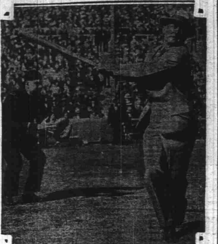
Ty Cobb raps out a hit on the first ball semi-officially pitched in San Francisco's new ball park Monday. Ty was imported to give the game a big sendoff.