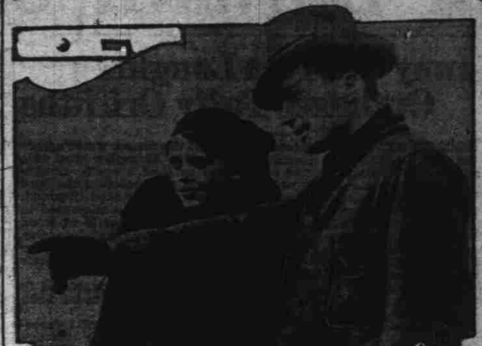
The first voyage of the Nautilus in which Sir Hubert Wilkins plans to travel under the North Pole, was touched by tragedy. Wilkins and... was lost as the submarine was nearing New York.