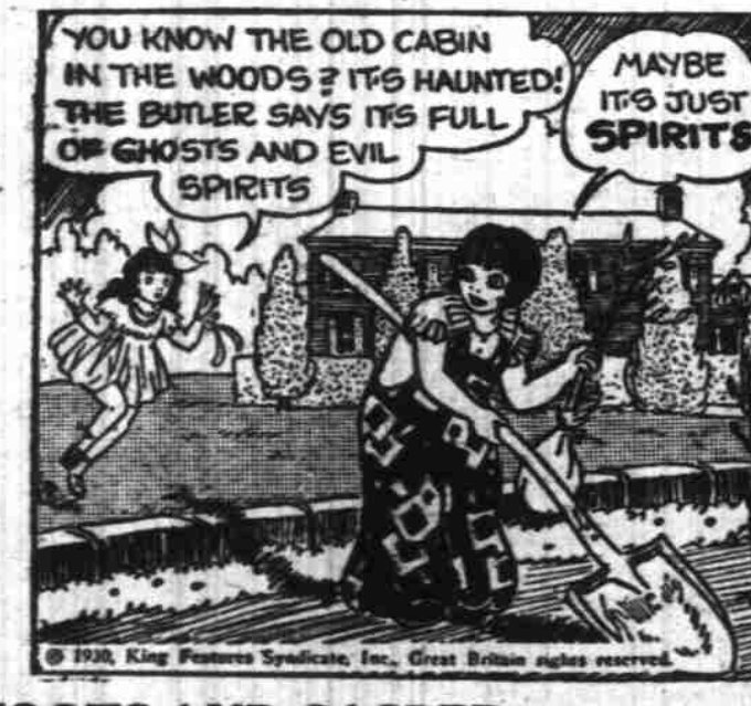
By BEN BATSFORD