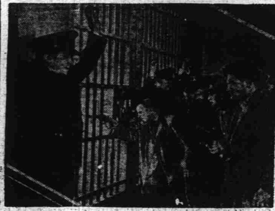
A powerful scene from the picture "The Big House" which will show at the Hollywood today, Monday and Tuesday.

Harold Lloyd Cuts Funny Capers at Bligh Daring Stunts in "Feet First" Will Give Audiences A Thrill