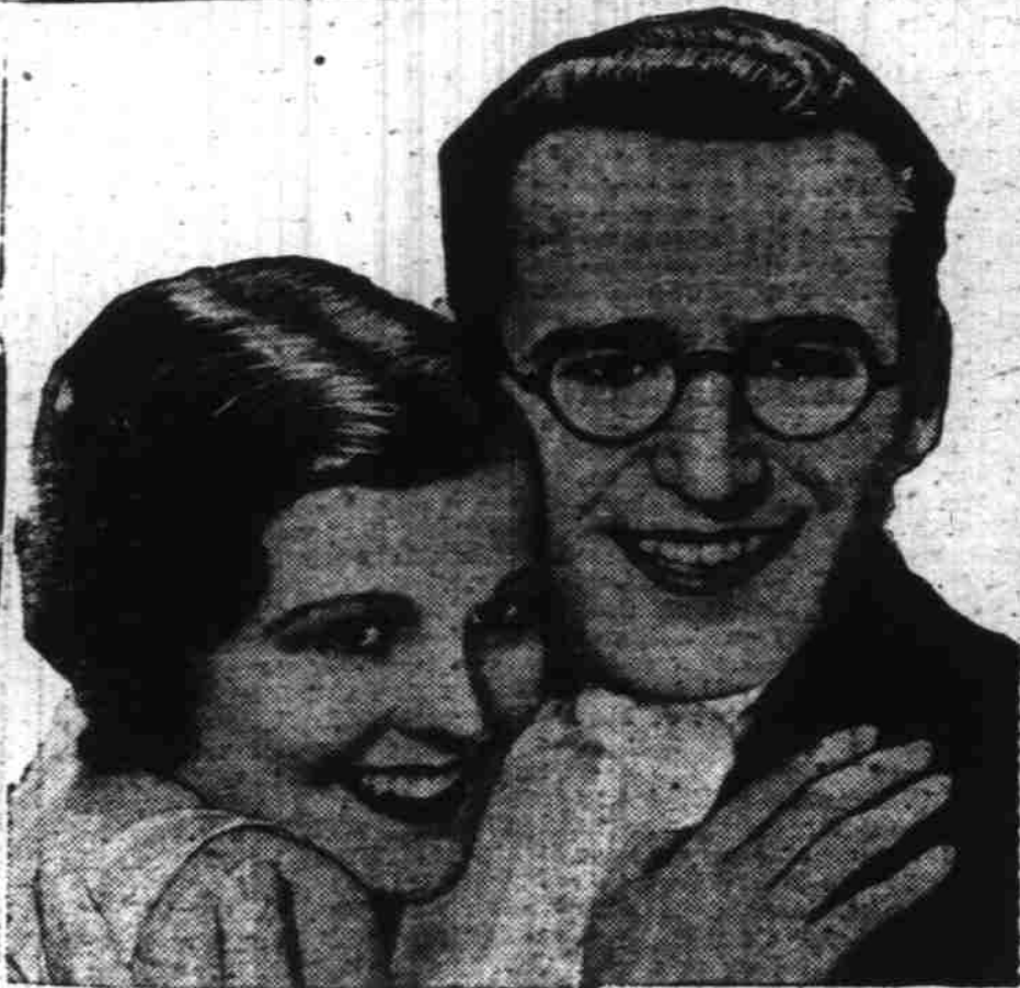
Harold Lloyd in a happy moment in the comedy "Feet First" now showing at Bligh's Capitol.