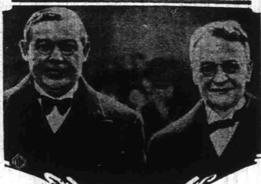
(Left to right) Walter E. Edge, of New Jersey, the United States Ambassador to France, and Dwight W. Morrow, former Mexican Ambassador, now New Jersey Senatorial candidate. They were pictured in the huge $15,000,000 municipal auditorium at Atlantic City, N. J., where they, with 25,000 others, viewed the first modern intercollegiate indoor football game. The eleven of Washington and Jefferson and Lafayette played a thrilling game with W. & J. emerging victorious.