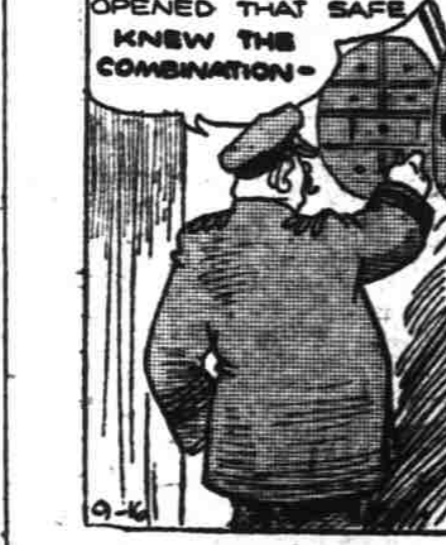
"IT WAS AN INSIDE JOB—THE BIRD WHO OPENED THAT SAFE KNEW THE COMBINATION—"