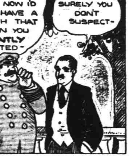
"YOUR SERVANTS ALL TELL STRAIGHT STORIES—NOW I'D LIKE TO HAVE A TALK WITH THAT ORPHAN YOU RECENTLY ADOPTED—"