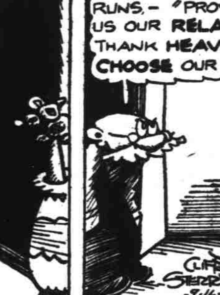
"EVER HEAR THE ONE THAT RUNS—'PROVIDENCE GIVES US OUR RELATIVES, BUT THANK HEAVEN, WE KIN CHOOSE OUR FRIENDS?'"