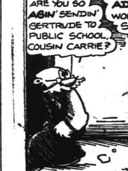
"JESS WHY ARE YOU SO AGIN' SENDIN' GERTRUDE TO PUBLIC SCHOOL, COUSIN CARRIE?"