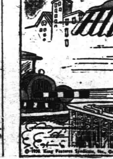
"WERE PULLIN' INTO TOWN NOW, TOOTS—WE HAD A NICE TIME AT UNCLE EVERETT'S ESTATE OVER THE WEEK-END, BUT I'M ALWAYS GLAD TO GET HOME AGAIN—"