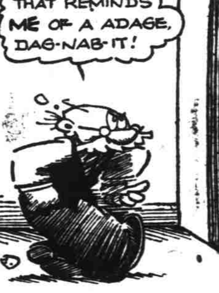
"THAT REMINDS ME OF A ADAGE, DAG-NAB-IT!"