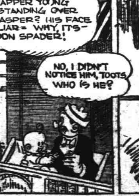
"NO, I DIDN'T NOTICE HIM, TOOTS, WHO IS HE?"