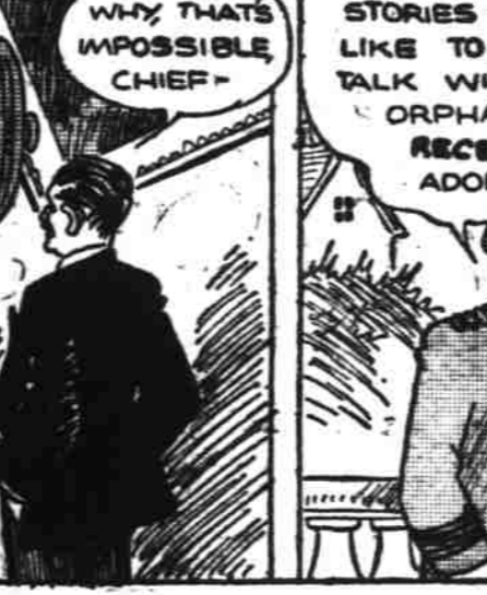
"WHY THAT'S IMPOSSIBLE, CHIEF—"