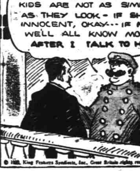
"IT'S MY BUSINESS TO SUSPECT EVERYBODY—SOME KIDS ARE NOT AS SIMPLE AS THEY LOOK—IF SHE'S INNOCENT, OKAY—IF NOT, WELL, ALL KNOW MORE AFTER I TALK TO HER—"