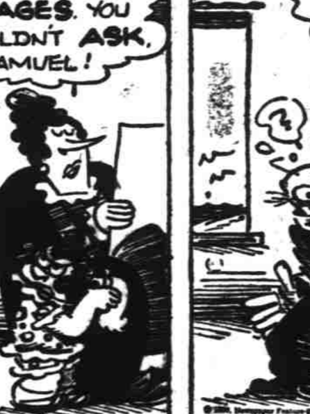
"IF YOU KNEW YOUR ADAGES, YOU WOULDN'T ASK, SAMUEL!"