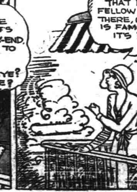
"DID YOU NOTICE, THAT DAPPER YOUNG FELLOW STANDING OVER THERE, CASPER? HIS FACE IS FAMILIAR—WHY, IT'S—IT'S DON SPADER!"