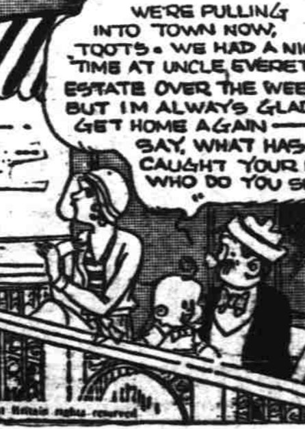
"SAY, WHAT HAS CAUGHT YOUR EYE? WHO DO YOU SEE?"