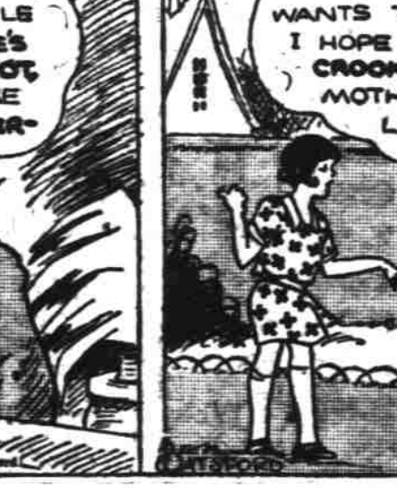
"STAY HERE, ZERO, THE CHIEF—OF—POLICE WANTS TO SEE ME—CEE, I HOPE HE FINDS THE CROOKS WHO STOLE MOTHER'S JEWELRY LAST NIGHT—"