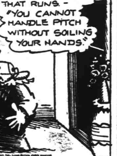
"PARTICULARLY THE ONE THAT RUNS—'YOU CANNOT HANDLE PITCH WITHOUT SOILING YOUR HANDS'."