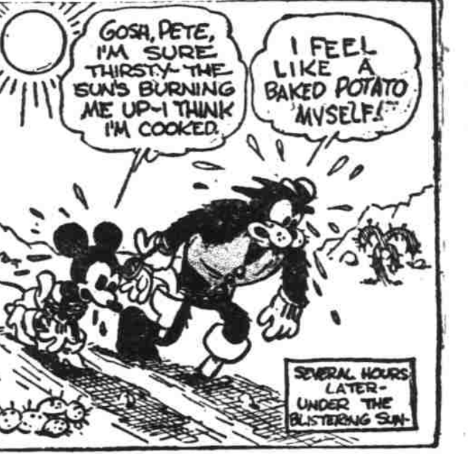
"A guy Can't Walk in his own Shadow"