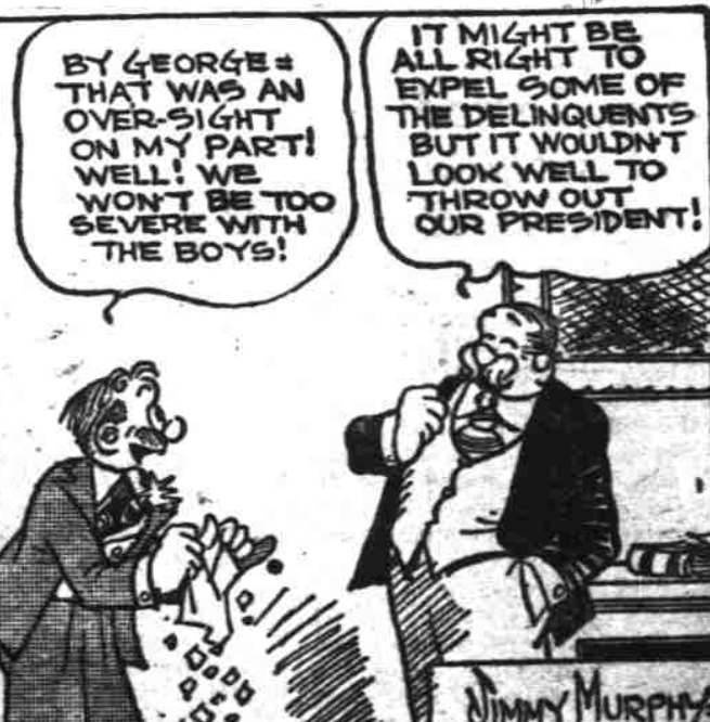
"Circumstances Alter Cases"