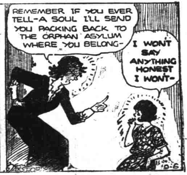
"A 'Hair-Raising' Experience!"