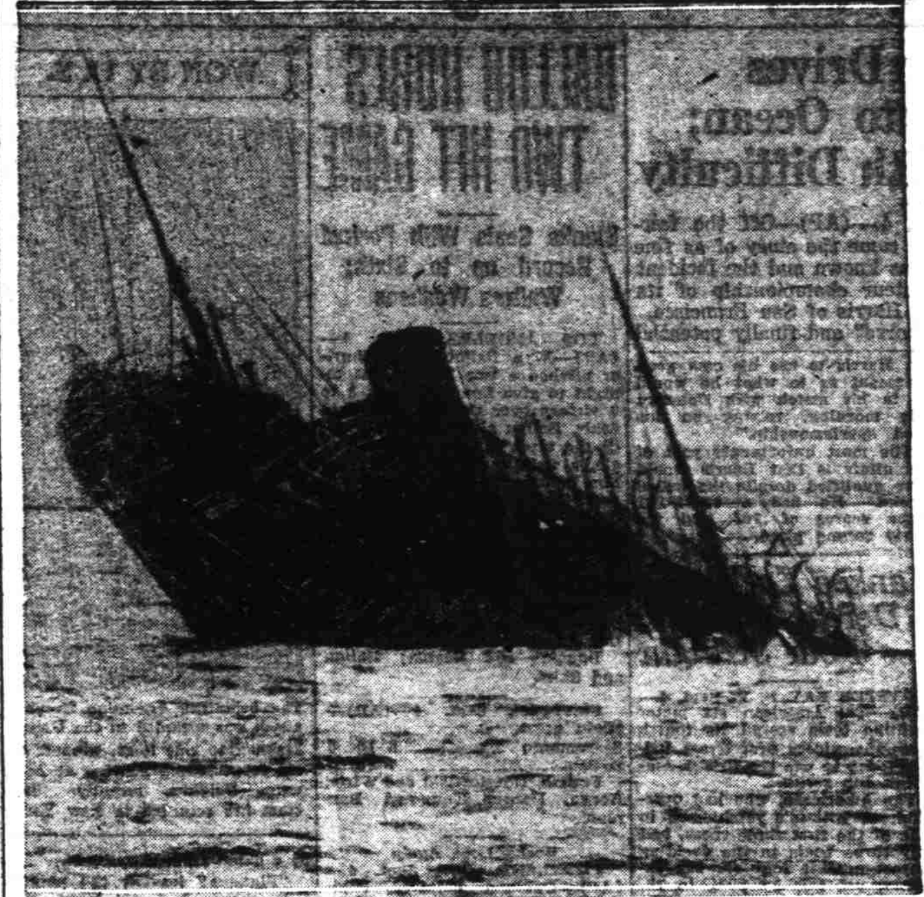
A few minutes after the picture was taken from the Ventura's deck, the liner Tahiti cank in 18,000 fathoms. The vessel went down a few hours after her passengers, crew and mail had been saved, ty fair.