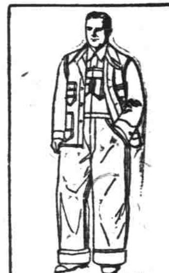
Biggest Buy in

COATS $12.50 Just arrived! Coats for Miller Day! Browns, tans, navy and black. Fur and cape collars. Well tailored . . . stylishly fashioned . . . all sizes.