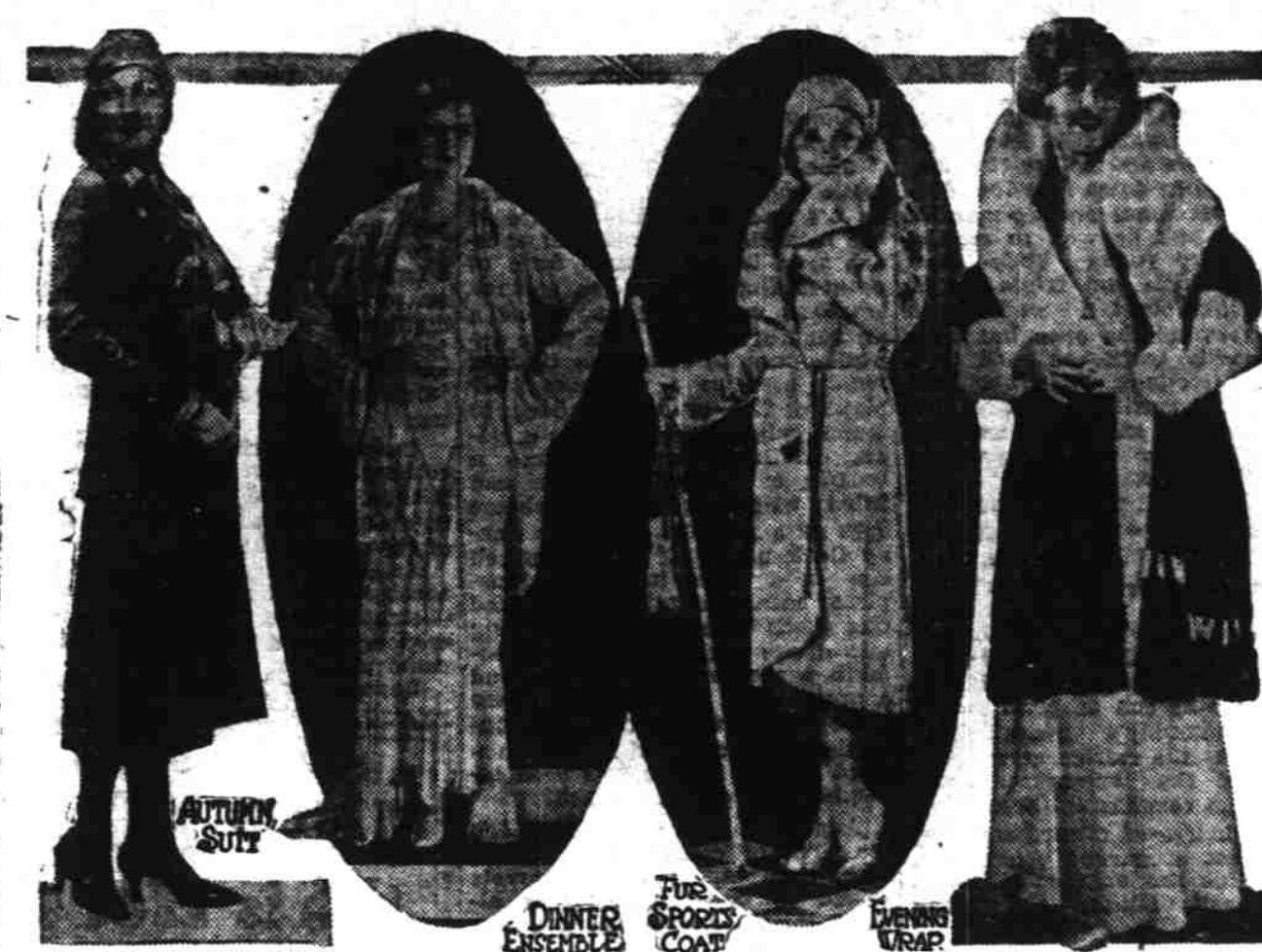
Harmonious blends predominate and produce chic and charm in styles designed for fall wear, while fur comes to the fore in all ways and costumes.