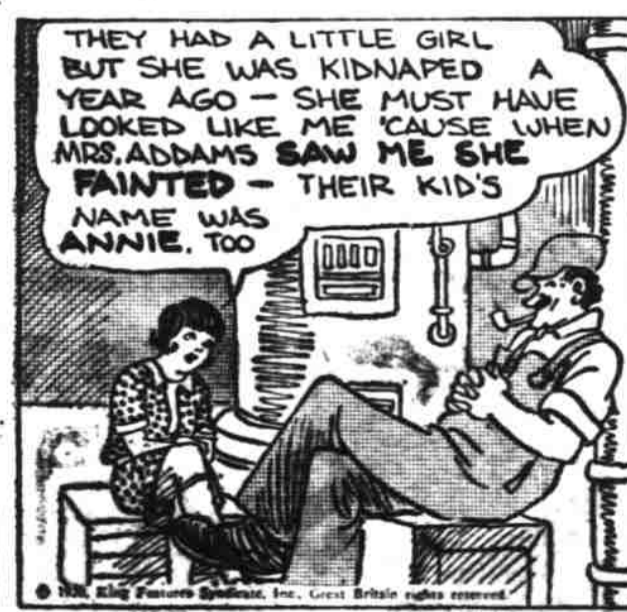
"A Strange Coincidence"