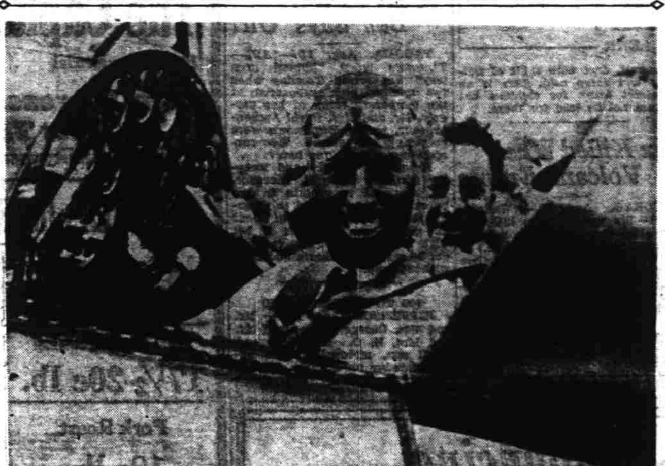
Telephoto transmitted to San Francisco from New York by Bell system shows closing of Captain Frank Hawks after landing at Curtis Field, Long Island, New York, after completing new record flight across United States. From Glendale, California, Hawks' time was 19 hours and 25 minutes, but the actual flying was done in 11 hours and 40 minutes. He beat the Lindbergh record made last Easter, by 2 hours and 25 minutes.