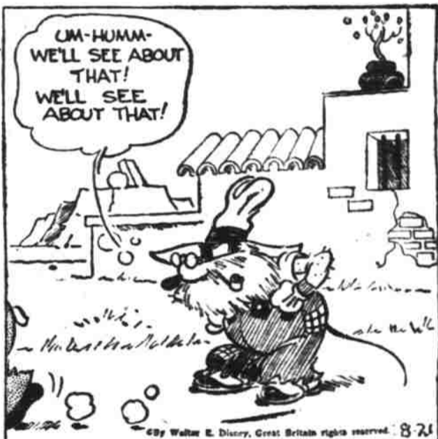
"One Woman Who Will Not Talk"