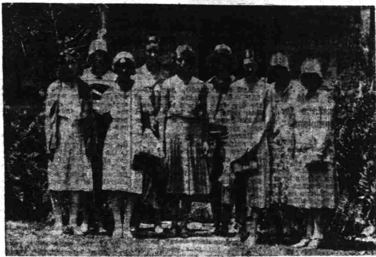
Journalism students of the University of Oregon Summer Session Cruise to Hawaii recently had the unique experience of visiting both the oldest printing house in Hawaii, established in 1823, and the plant of the Honolulu Star-Bulletin, one of the most modern of plants. The class is shown here in front of the old stone building, which is claimed to be the first established west of the Rocky Mountains.