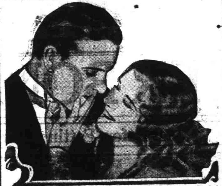
Marilyn Miller and Alexander Gray in "Sally," which will christen "better movie" season at the Grand, Sunday.

NOTE—The Fox Elsinore is the only Theatre in Salem showing the new season's product.