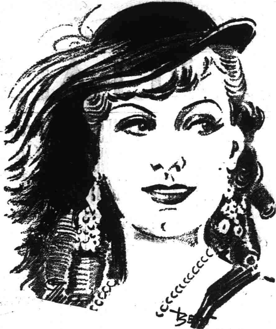
Here is a view of Greta Garbo who as the famous opera singer, Cavallini, does some excellent work in an unusual play "Romance" now playing at the Fox Elsinore.