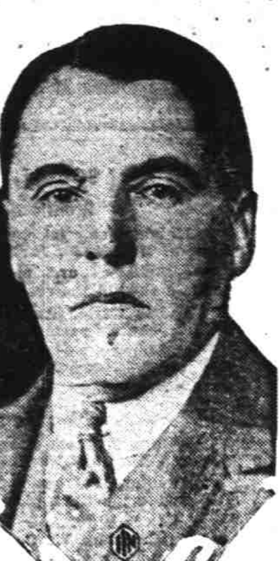
The Earl of Birkenhead, lawyer and politician and leading figure in British life for many years, at the age of 53 is seriously ill with bronchial pneumonia. A slight improvement in his condition has been noted in the last twenty-four hours.