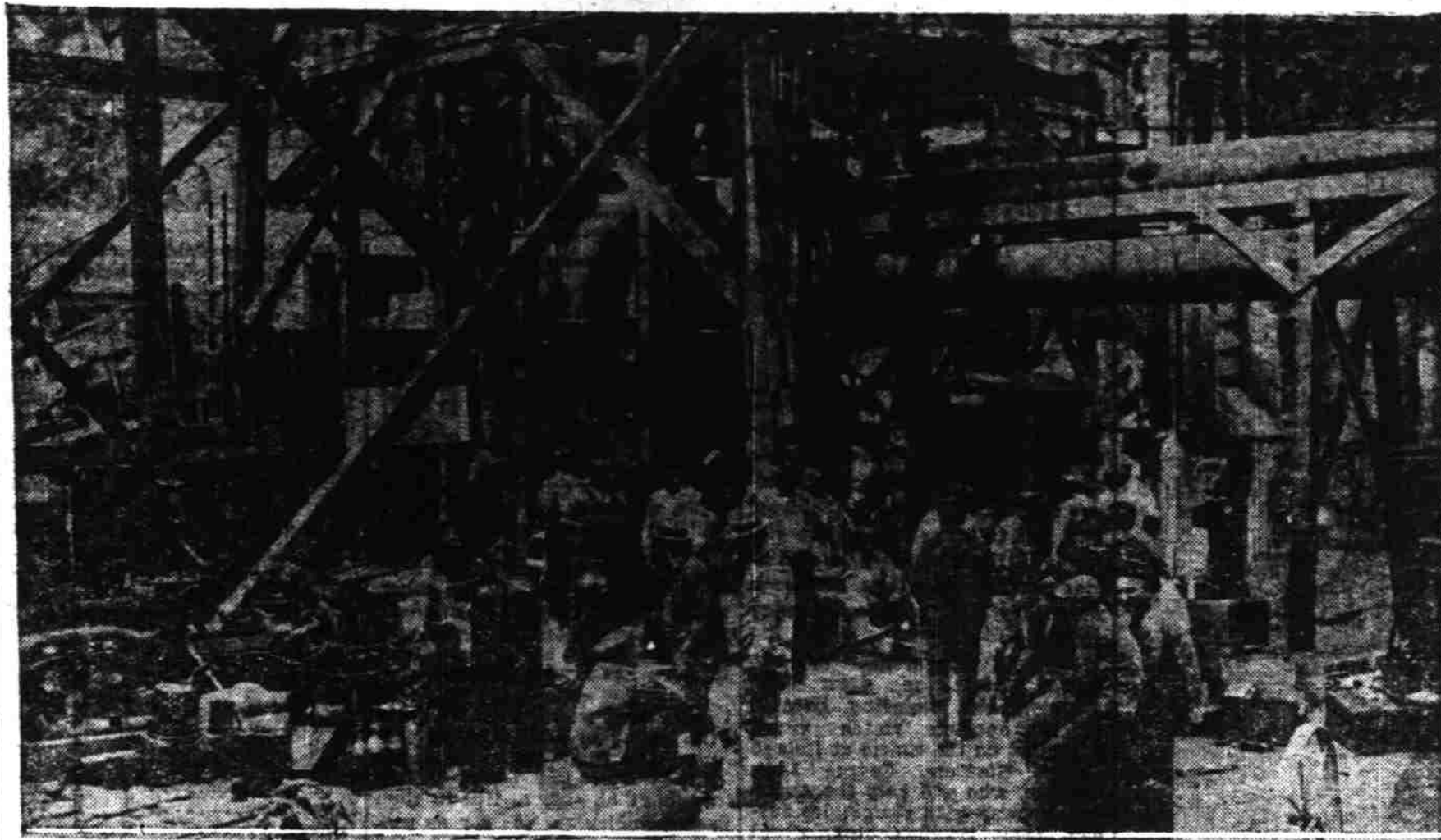
Scene at tunnel shathouse at the Hetch-Hetchy waterworks projects where twelve men were killed by an explosion of natural gas last Wednesday.