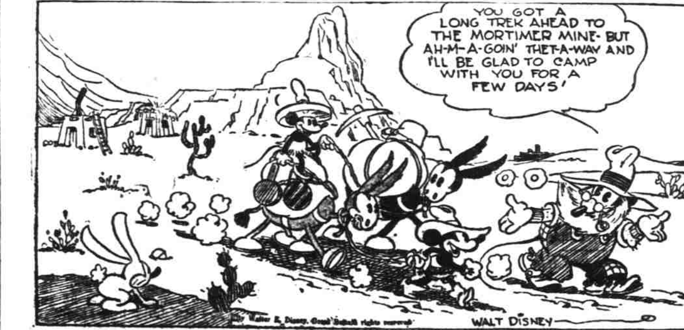
"And Jake Was Only A Tenderfoot"