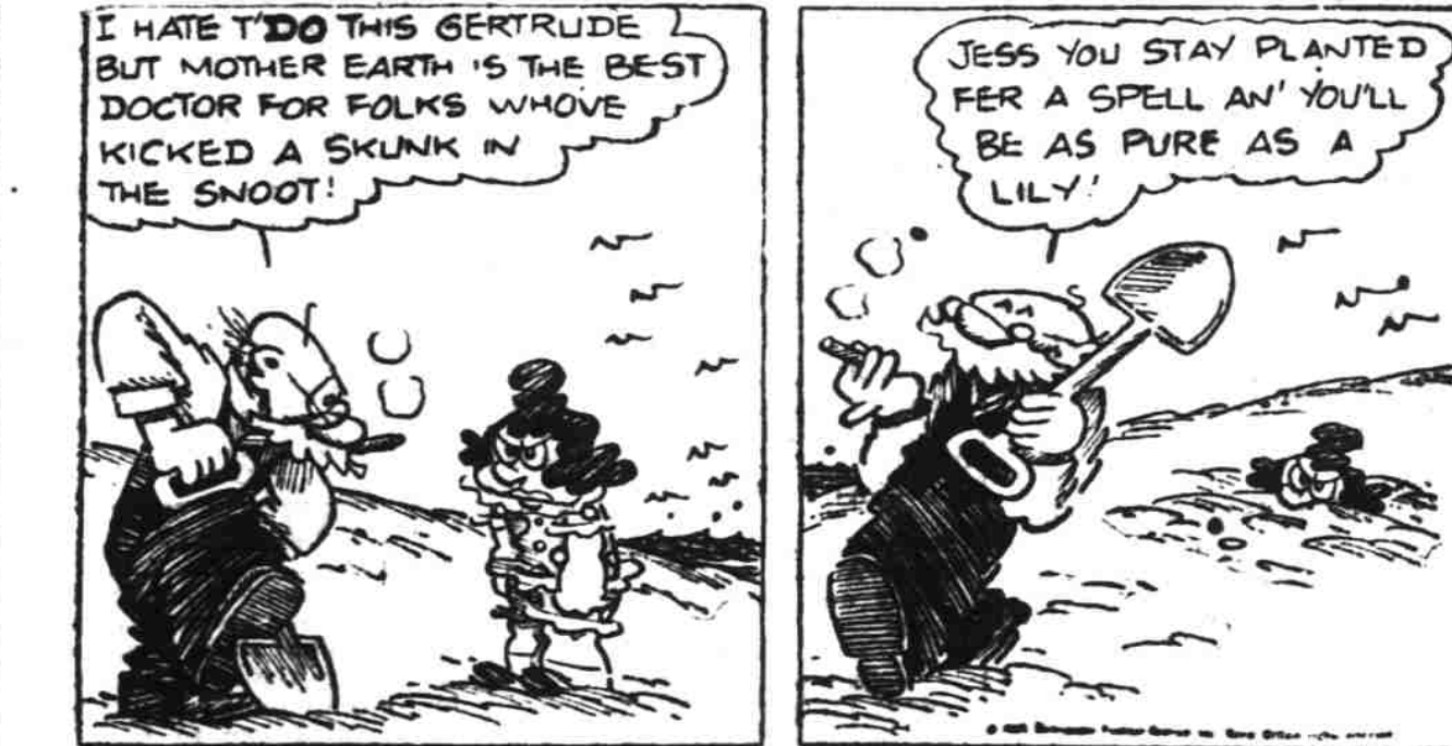
"Two Of A Kind"