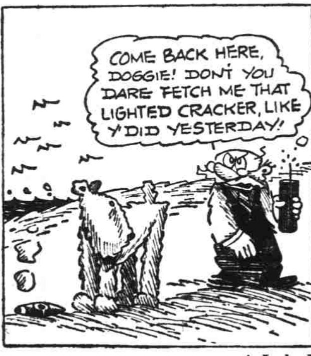
A Lady With Ambitions