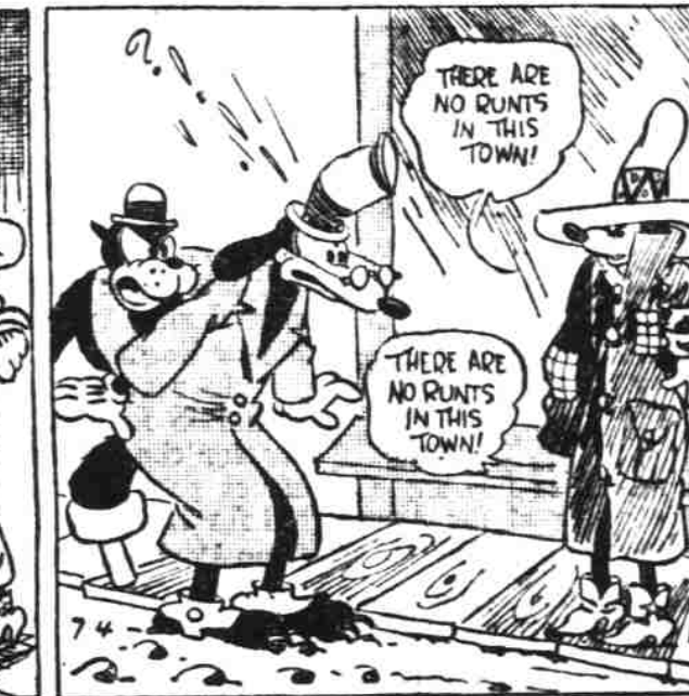
By CLIFF STERRETT