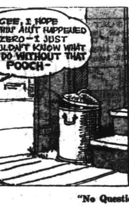
TOOTS AND CASPER