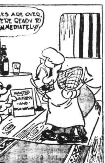
"Enough To Make Her Head Swim"