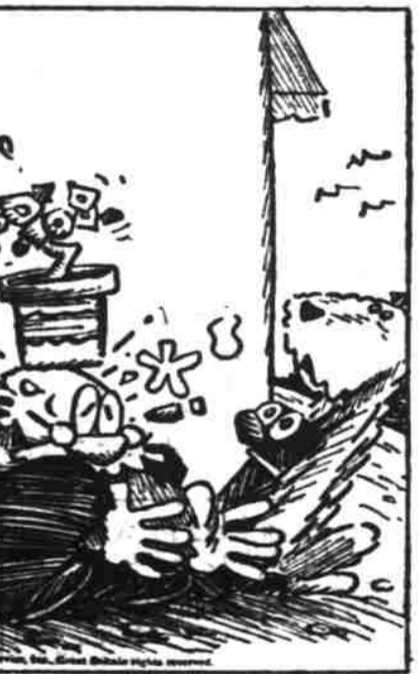
"No Question About It"