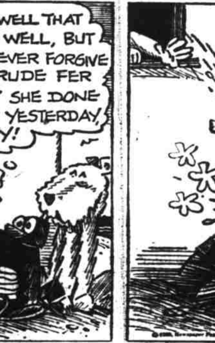
TOOTS AND CASPER