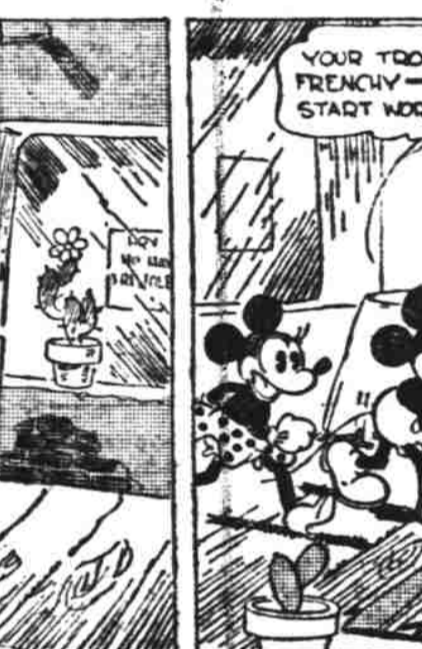
"His Master's Voice"