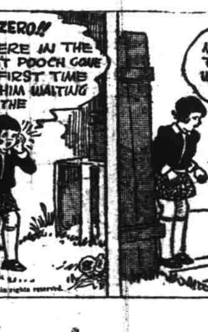
TOOTS AND CASPER