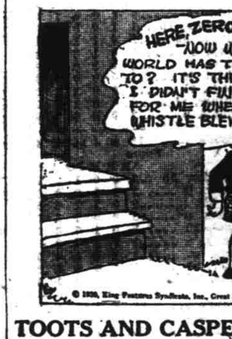
TOOTS AND CASPER