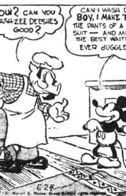
By BEN BATSFORD