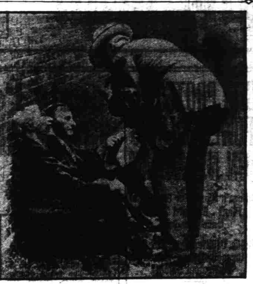
"Settin' comfortable" in Calvin Coolidge, former President of the United States (center), as he greets a friend in a most informal manner outside the gymnasium of Amherst College. Coolidge attended the commencement exercises of the alma mater of his son and also of his wife.