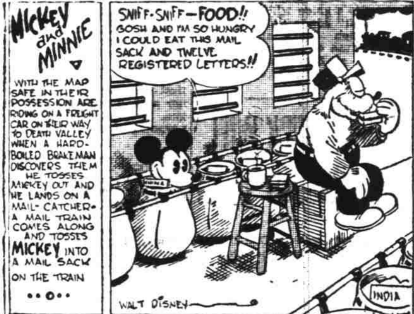
"The Uninvited Guest"