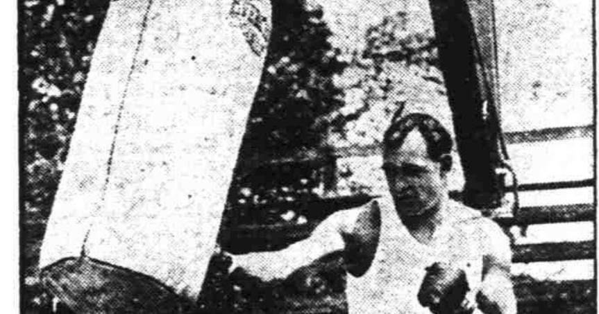
Jack Sharkey unpacks a hefty clout that sends the big bag spinning as he goes through his second day in preparation for his world championship bout with Max Schmeling, German champ, June 12th, in the Yankee Stadium, N. Y. The gob's weight continues at about 200 each day following his routine. He says he will win the championship by a knockout within five rounds.

Hollywood Breaks Losing Streak With Bang, Taking Double Header