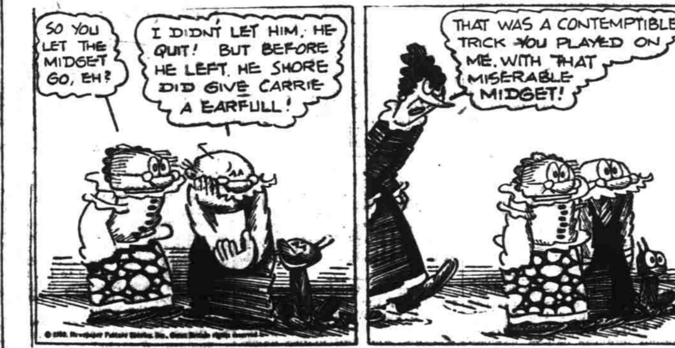
"A Broad-Minded Relative"